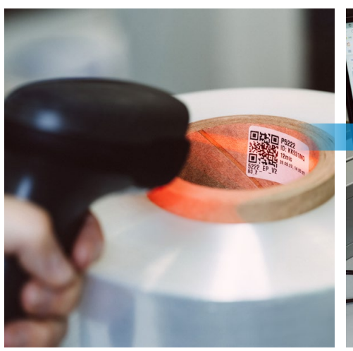
The traceability of production processes offers numerous advantages. It enables companies to improve the quality of their products and ensures that they meet the set requirements and standards.

been equipped with bitWise but older machines can be retrofitted relatively easily. Generally, this is done by making the control unit ready for data exchange based on the OPC-UA standard. On lines with a newer machine control, OPC-UA can be activated using a simple software update without any modifications of the hardware. On other lines, either the control unit is changed completely or an additional controller is added for communication. Apart from the control of the machine, other components of an SML extrusion line, such as the thickness measurement unit, inspection devices or dosing units can generate data for bitWise, if they are connected via OPC-UA.