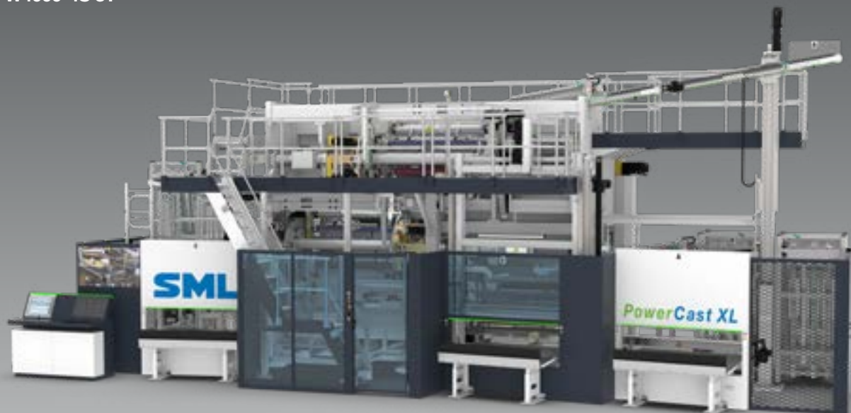
WINDING UNIT Winder W4000-4S 3T