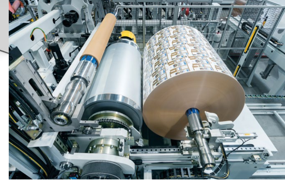
Drum winder W1800 for big diameter reels