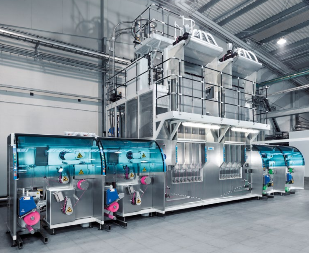
Austrofil® BCF multifilament line

In the BCF segment, SML has finished the development of a new 11.5 t/day Tricolor concept, offering maximum of efficiency and flexibility in carpet production, including the usual range of color combinations for BCF yarns. In comparison with SML's existing Tricolor model, which has become an established fixture worldwide, the new line has 50 percent higher production capability at a better price-performance ratio. As well as its tricolor operation, the new design offers the useful option of operating the