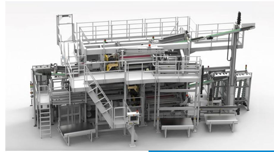
Brand-new W4000-4S-3T triple turret winder

The three turn-over units of the new W4000-4S-3T triple turret winder are arranged on top of one another and supported by a massive main frame. A small footprint is a signature part of this design, saving our customers valuable space on the shop floor. The film inlet section unit has been raised to ensure equal film lengths and tensions for each turn-over unit. Walkable platforms around and inside the winder ensure a fast start-up process and ease of maintenance. When changing between 2- and 3-inches, the winding shafts can be stored in magazines and remain in the winder. Additional automated equipment reduces the effort required for conversion reducing downtime to a bare minimum.