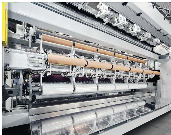
SML's most innovative winder in 4 station design (simple in mechanism and easy to operate)

SML's winder 3000 has a good reputation as an inline-slitter for the production of stretch film rolls on 2inch and 3inch cores. The unique innovation: The individual winding cores are supported